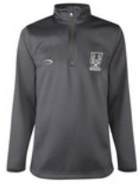
1/4 zip black top